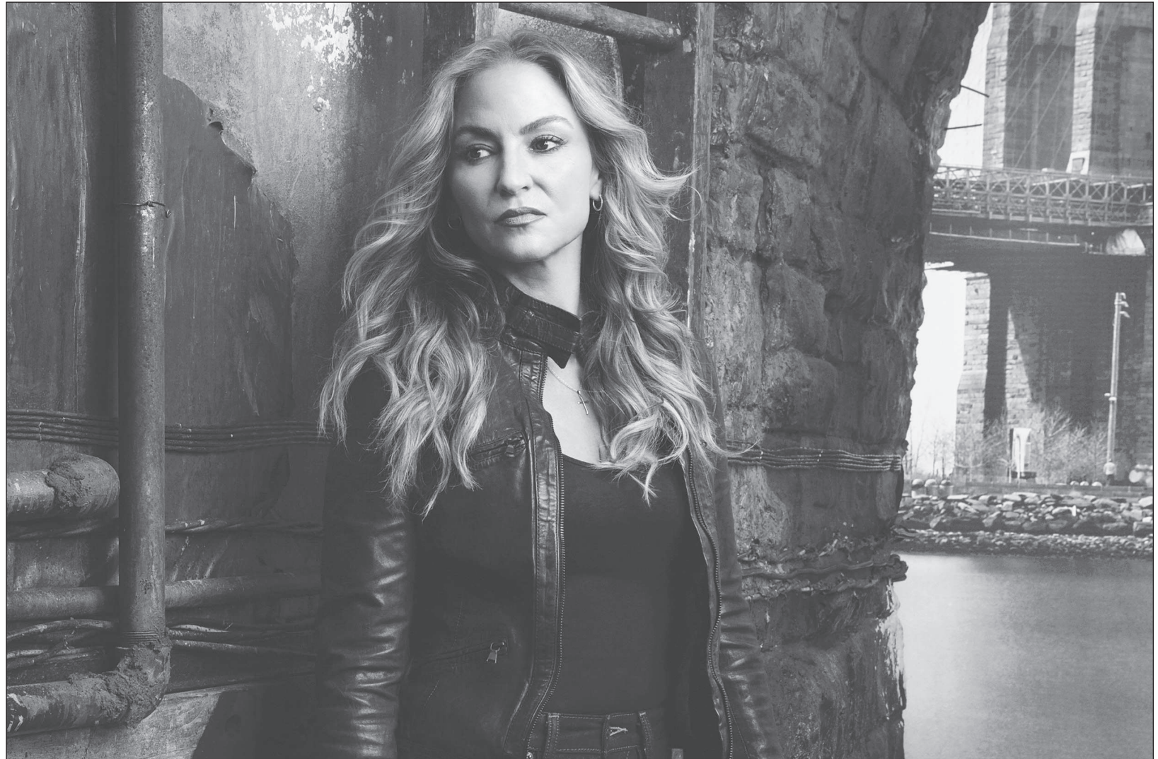
Drea de Matteo as seen in "Shades of Blue"