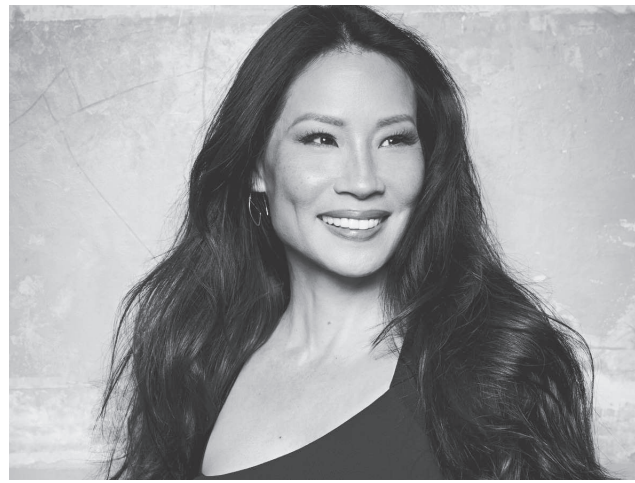
Lucy Liu stars in "Elementary"

Part 2 of this groundbreaking special takes a look at how today's world was shaped by the rise of partisan politics, and at the origins of the Monica Lewinsky scandal. The program also explores the fall of the media and the move from offline to online.