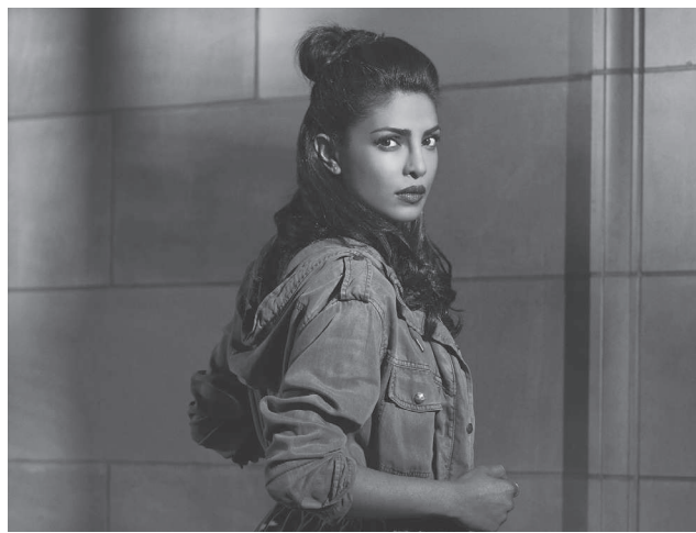
Priyanka Chopra stars in "Quantico"

Bell's (Bruce Greenwood) patient is accidentally set on fire during surgery in this rebroadcast, forcing the hospital to start an investigation. Meanwhile, Nic (Emily VanCamp) finds herself being investigated in Lily's (Violett Beane) death.