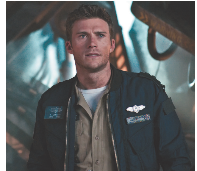
Scott Eastwood in "Pacific Rim: Uprising"

Born with a rare genetic disorder, teenager Katie (Thorne) has a life-threatening sensitivity to sunlight and is completely housebound during the day. While out after dark one night, she's asked out by her handsome crush Charlie (Schwarzenegger), who is unaware of her condition. As the two begin a romance, they find themselves drawing ever closer, but Katie finds herself unable to tell Charlie the truth, despite her well-meaning father (Riggie) warning her that keeping him in the dark is the wrong thing to do. Director: Scott Speer. Stars: Bella Thorne, Patrick Schwarzenegger, Rob Riggie, Quinn Shephard. 2018. 91 min. Drama.