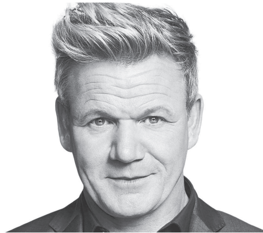
Gordon Ramsay hosts "Gordon Ramsay's 24 Hours to Hell and Back"

An uprising of purist vampires leads to a deadly showdown between the supernatural factions in this new episode.