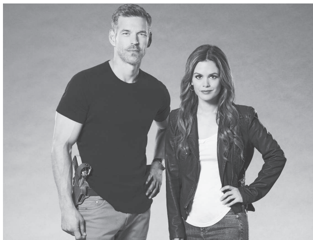
Eddie Cibrian and Rachel Bilson star in "Take Two"

Following an epic public breakdown, actress Sam Swift (Rachel Bilson) is ready to start over by shadowing private investigator Eddie Valetik (Eddie Cibrian) in this premiere. Although Eddie initially resents her, Sam soon proves to be a valuable partner.