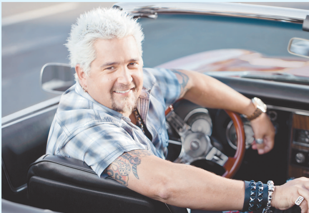
"Guy's Ranch Feast" host Guy Fieri as seen in "Diners, Drive-Ins and Dives"

Chefs show off their chops in 'Guy's Ranch Feast'