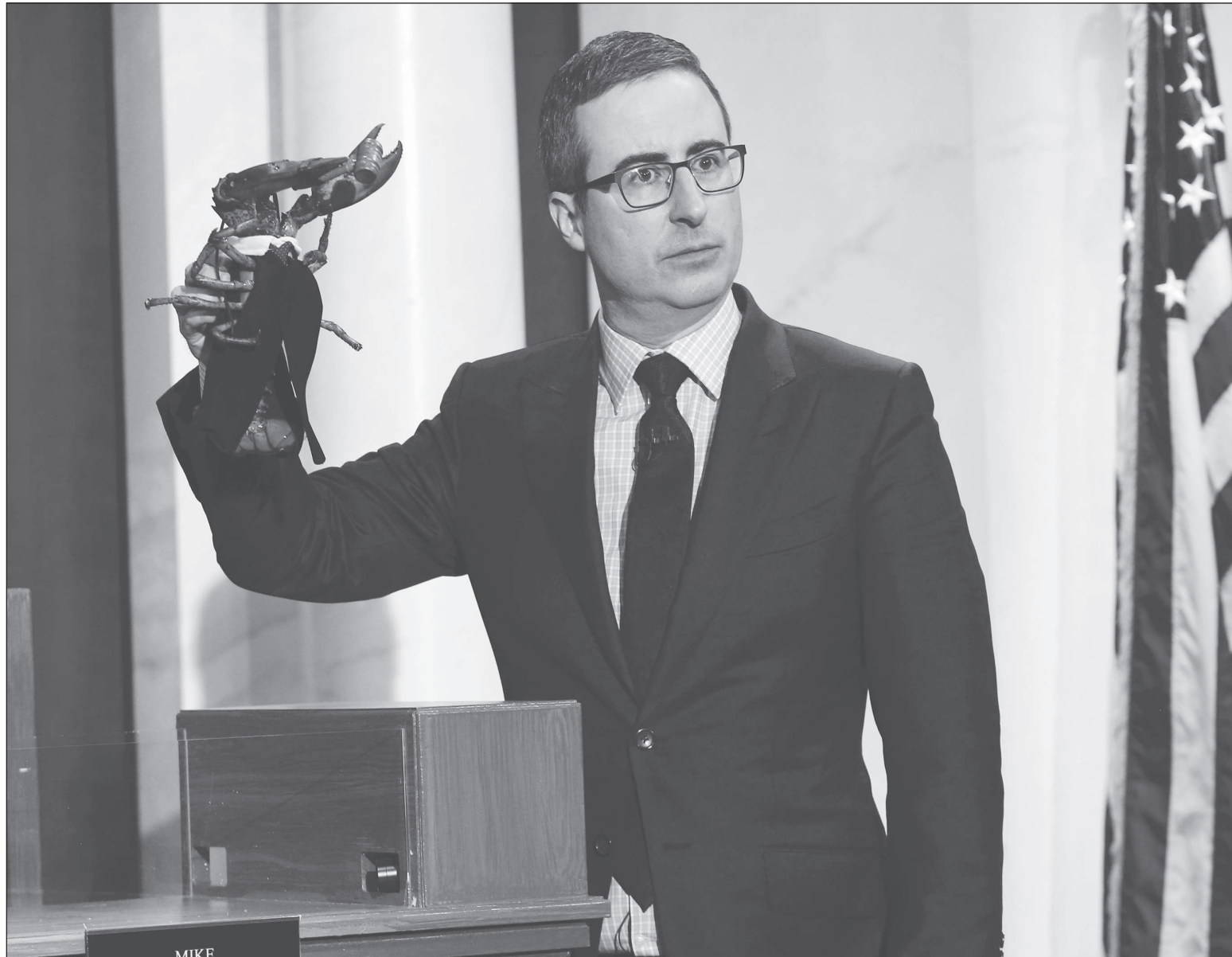
John Oliver in "Last Week Tonight With John Oliver"

Oliver has worked his way up through the entertainment industry since starting out as a standup comedian in the United Kingdom. Before "Last Week Tonight," he was best known to North American audiences for his work on Comedy Central's "The Daily Show" as the program's senior British correspondent, and he later filled in as interim host when Jon Stewart ("Rosewater," 2014) went on hiatus.