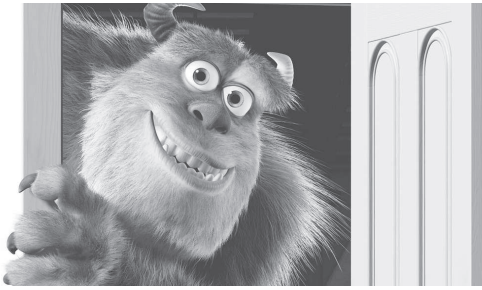
Sully in "Monsters, Inc."