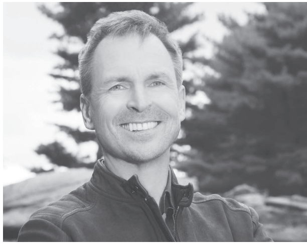
Phil Keoghan hosts "The Amazing Race"

After weeks of racing all around the world, the remaining teams dash to the finish line in this season finale. Host Phil Keoghan welcomes the racers to their final destination as one team wins the $1 million grand prize.