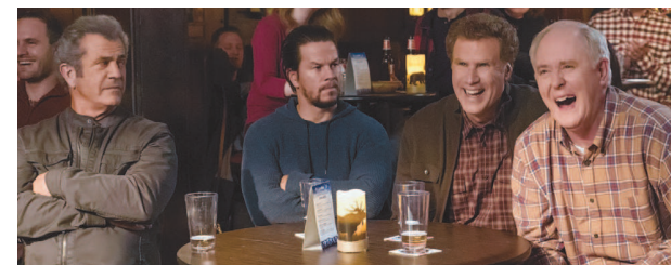
Mel Gibson, Mark Wahlberg, Will Ferrell and John Lithgow in a scene from "Daddy's Home 2"