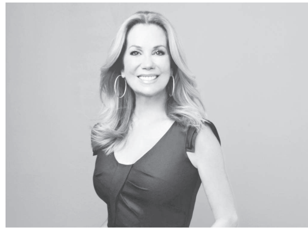
Kathie Lee Gifford co-hosts "Today With Kathie Lee and Hoda"

The Waverider gets blown up over and over again when Zari (Tala Ashe) becomes trapped in a time loop in this new episode, and the key to escaping seems to lie hidden among the many secrets that her shipmates are hiding.