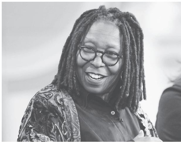
Whoopi Goldberg as seen in "The View"

The ER staff tackles an unusual case when they treat a man with a sword through his head in this rebroadcast. Also, a critically ill patient is too afraid of germs to allow doctors to treat him, and two patients with life-threatening symptoms come in.