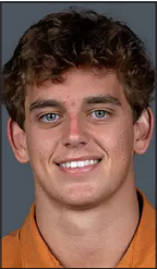
ARCH MANNING QB, Texas

• Recorded more than 100 tackles, 16.5 tackles for loss and 8 sacks for the Longhorns in 2024.