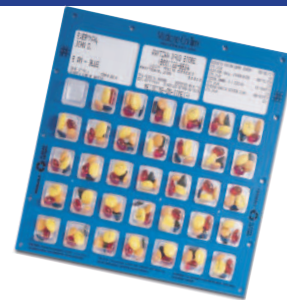
Medication Management System

Medicine-On-Time is an innovative personal prescription system that takes the daily hassle out of taking medicine. No more juggling pill bottles. No More guesswork about dosages and times. With Medicine-On-Time, you can never miss a dose of medicine again.