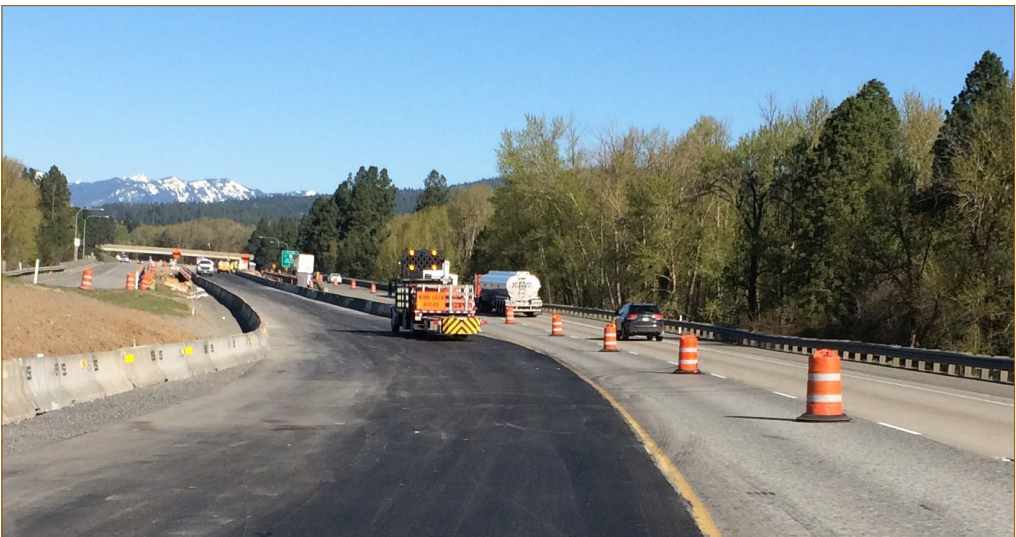
Temporary detour for bridge work near Cle Elum.