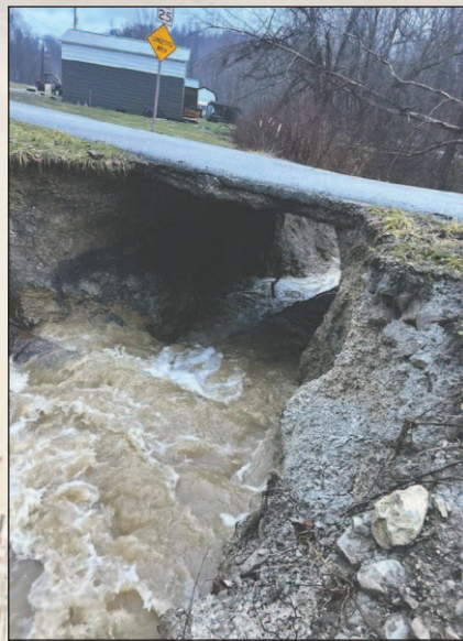
The washed-out culvert at Barbeque Road and Barbeque Spur is pictured.

cued after getting stranded in the floodwaters, authorities in West Virginia said. And the rescues weren't limited to humans. The Kanawha-Charleston Humane Association asked the community to adopt or foster 15 dogs after a portion of its shelter began to get