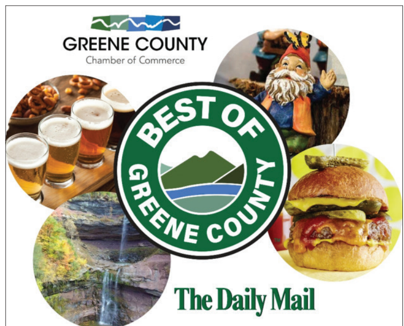
Greene County photo The logo for The Best of Greene County 2020.