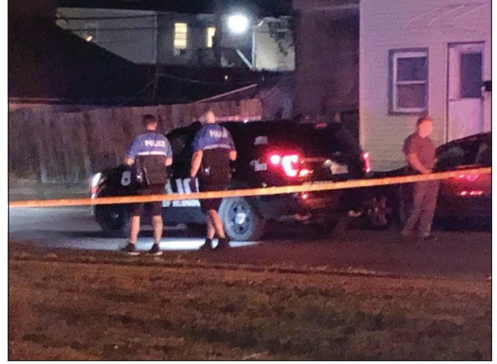
Multiple police agencies at the scene of a stabbing in Hudson on Wednesday night.