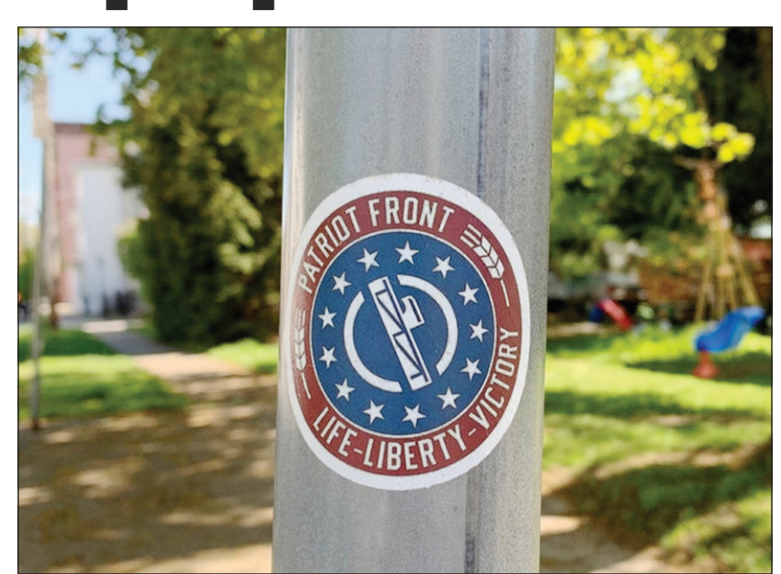
A Patriot Front sticker was found in the Village of