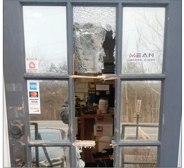
Contributed photo The smashed door at Country Armory in Coxsackie last week.