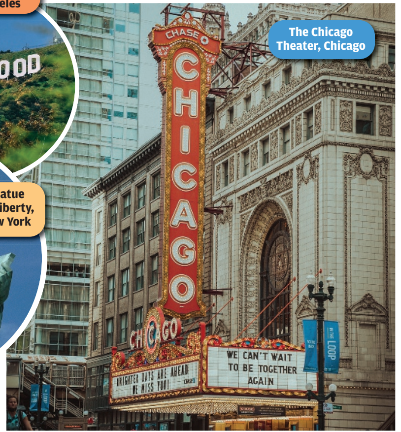
The Chicago Theater, Chicago