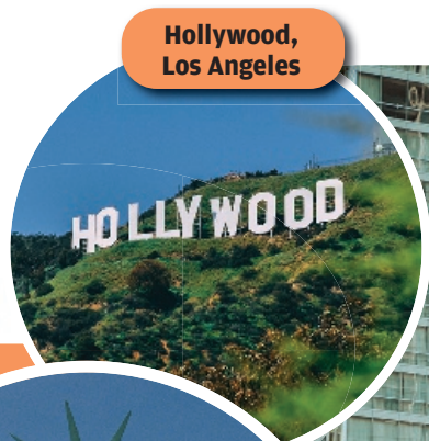
Hollywood, Los Angeles