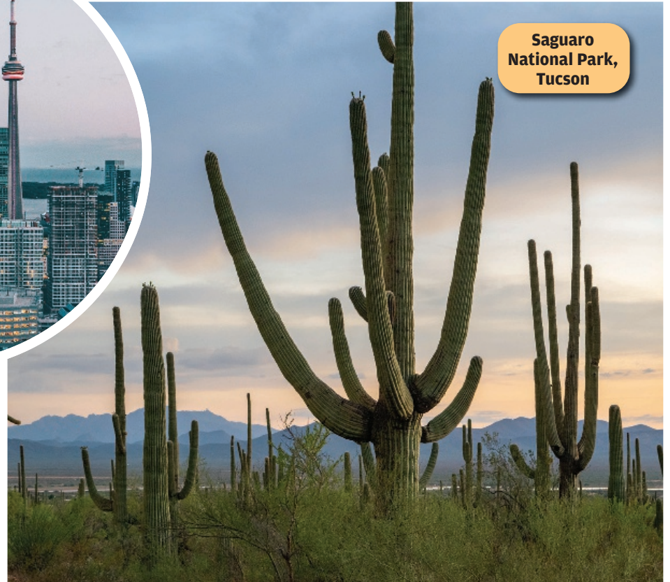
Saguaro National Park, Tucson