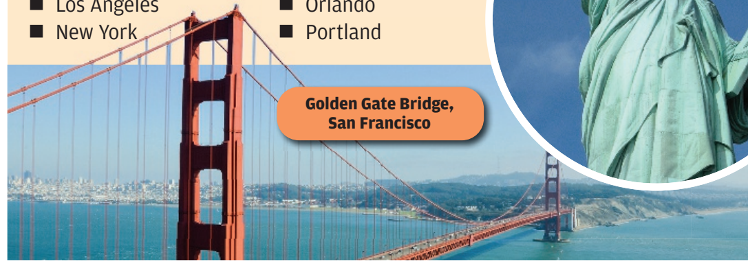
Golden Gate Bridge, San Francisco