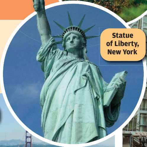
Statue of Liberty, New York