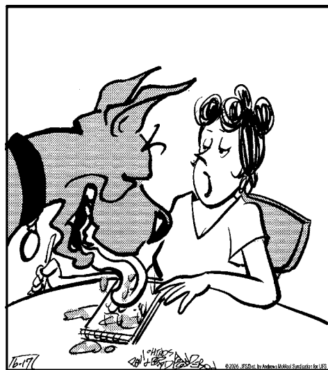
"Stop drooling on the shopping list."