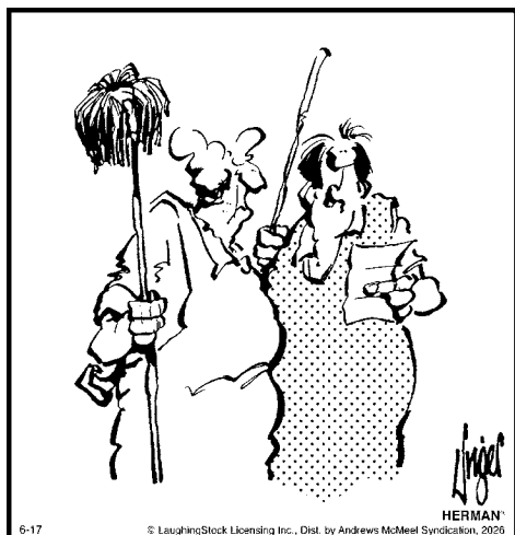
"I asked that lawyer on the third floor what time he wanted me to clean his office and he sent me a bill for a consultation."