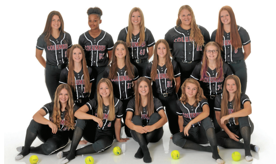
GOC’S CREATIVE IMAGES

Top Newcomers: We have a few kids vying for positions on the court with only two hitters that were starters for us last year. It is too soon to tell who those contributors will be, but we will have some awesome competition as we begin fall practices.