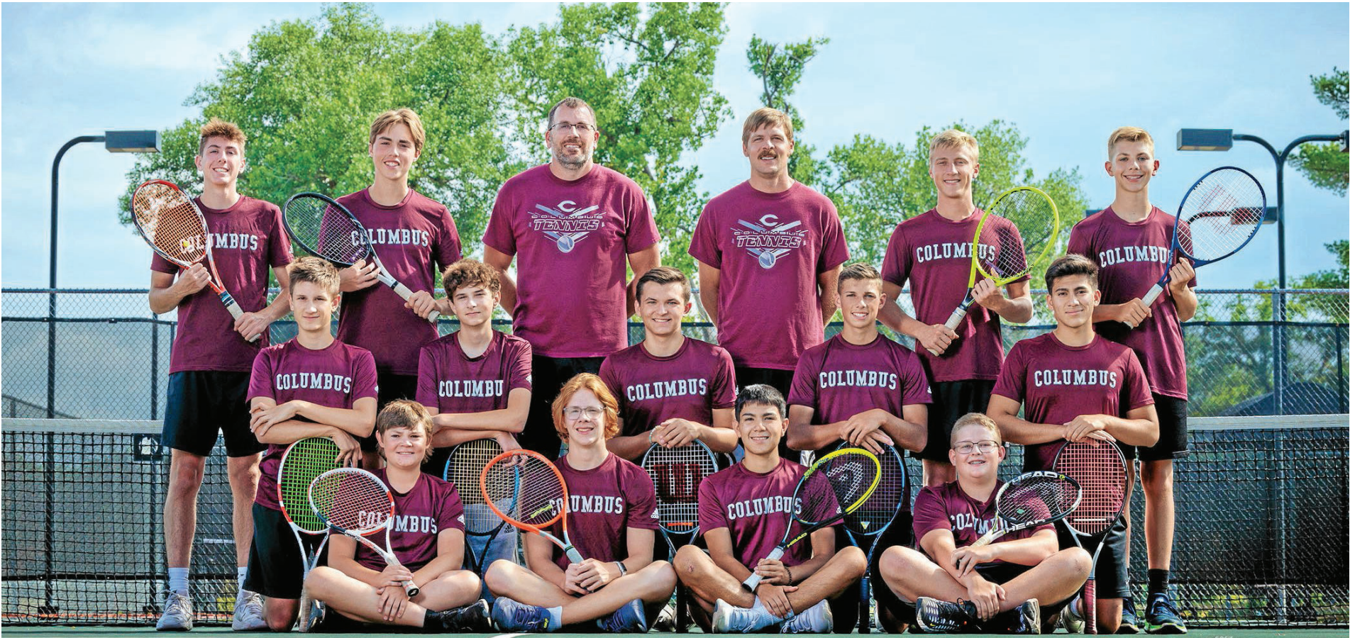
GOC'S CREATIVE IMAGES