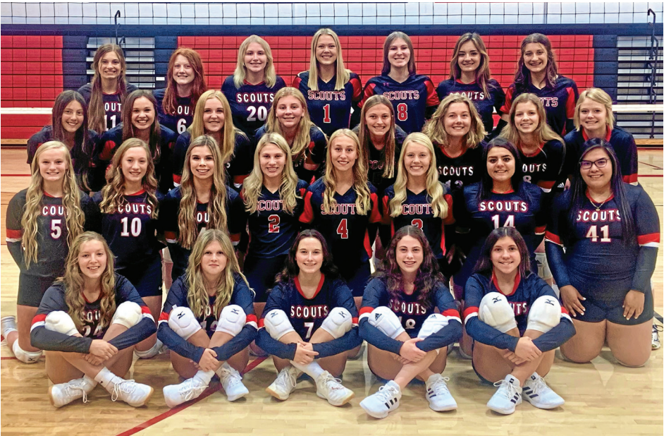
GOC'S CREATIVE IMAGES