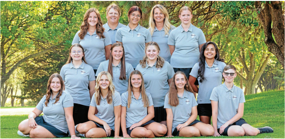
GOC'S CREATIVE IMAGES