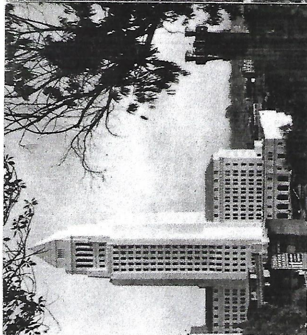
LOS ANGELES' city hall overlooks a sunny metropolis of broad boulevards, lovely homes and gardens.