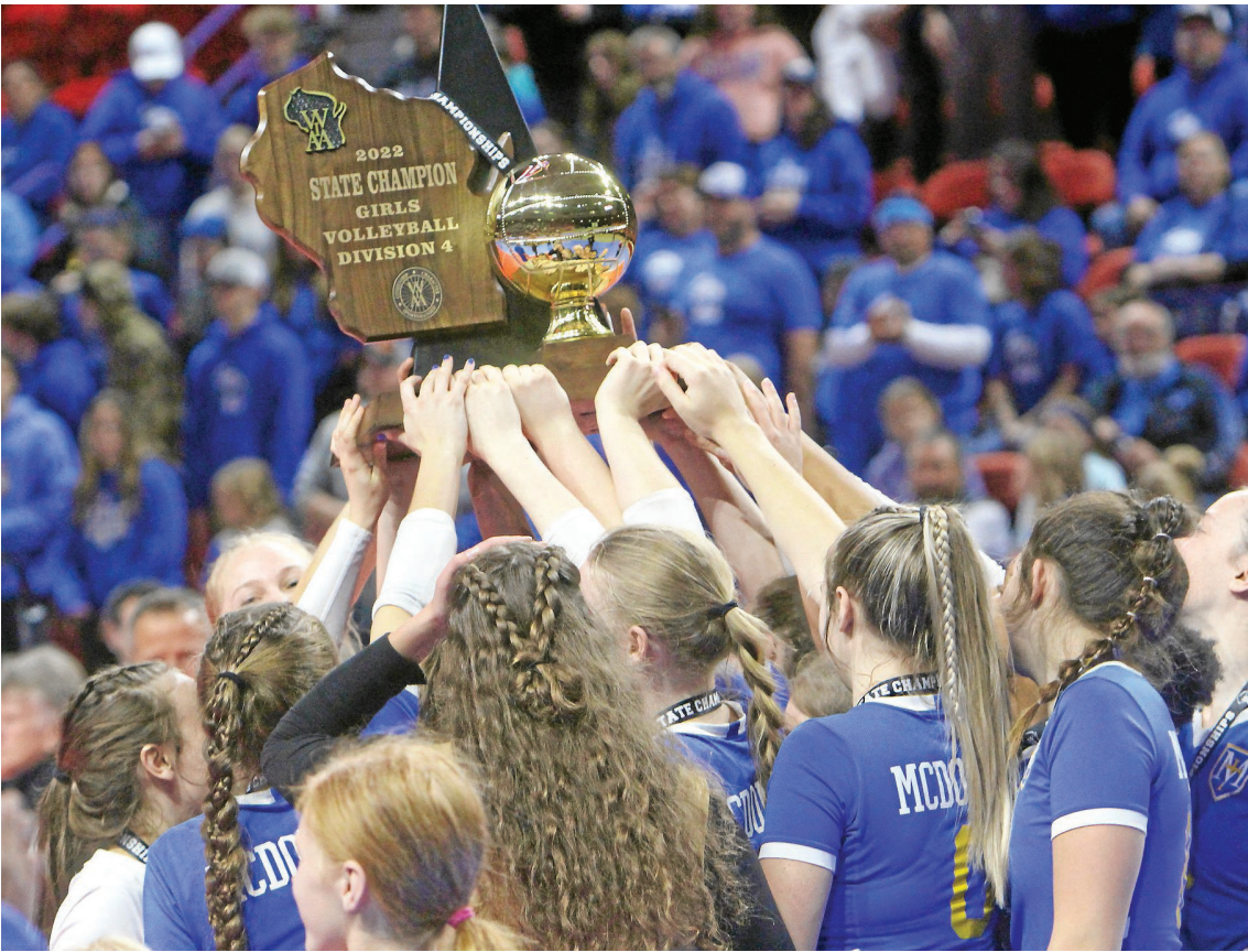
The McDonell volleyball team celebrates with its newly won Division 4 state championship trophy after defeating Monticello on Saturday morning at the Resch Center in Green Bay.