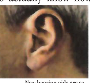
New hearing aids are so small, they practically vanish to the ear

to prioritize what wearers need to hear, and how to suppress, or block, extraneous noise.