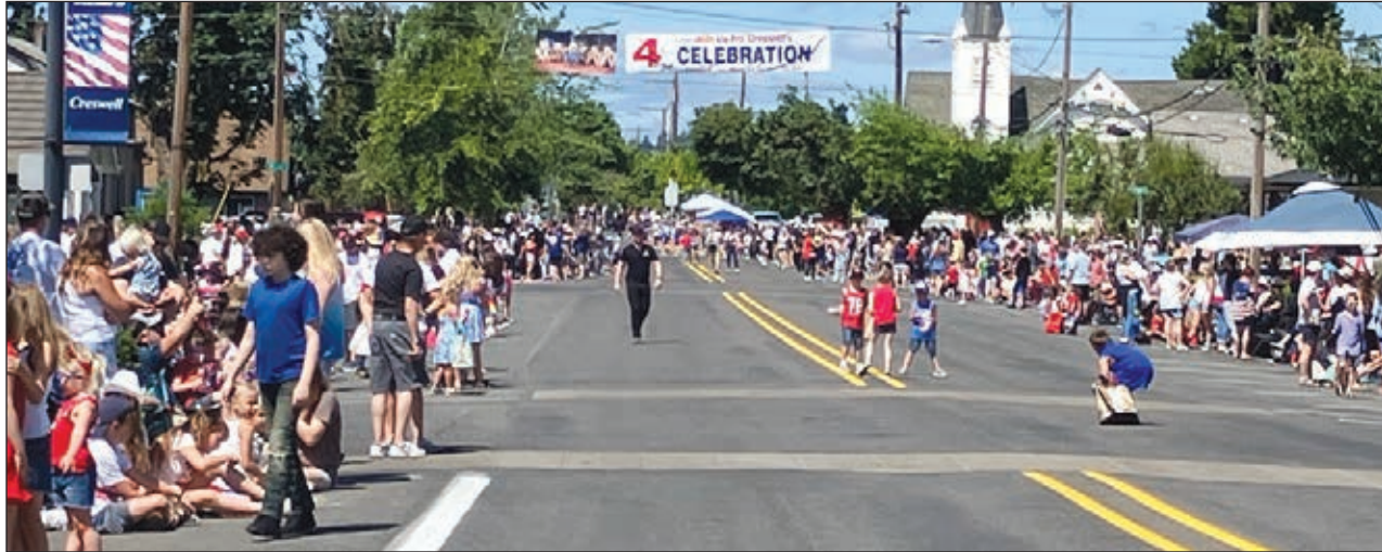
Thousands of spectators line Oregon Avenue as they await the arrival of the parade. See more photos with this story at cgsentinel.com