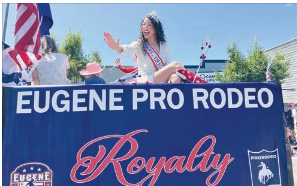
Mrs. Oregon, sporting fashionable boots, enthusiastically waves to the crowd riding on the Eugene Pro Rodeo float.

If your congregation would like to be a part of this worship directory, contact us today!