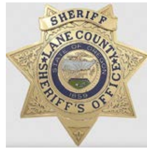
Investigators ask anyone with information about this case is asked to contact the Lane County Sheriff's Office at 541-682-4150.

Corruption of a Child in the Second Degree. The investigation is ongoing. Investigators ask anyone with information about this case is asked to contact the Lane County Sheriff's Office at 541-682-4150.