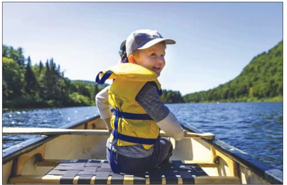
Metro Creative Connection

• In Oregon, all motorboat operators with propulsion greater than 10 horsepower must take a boating safety course and carry a boating safety education card when operating the boat. Paddlers of non-motorized boats (kayaks, canoes, rafts, stand up paddleboards and their inflatable versions) are required to purchase a Waterway Access Permit. The Marine Board also offers a free, online Paddling Course (also available in Spanish) for boaters new to paddling activities.