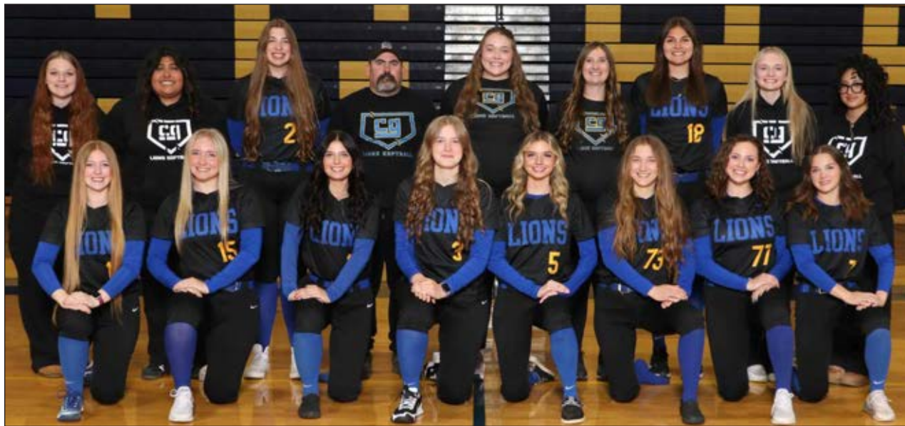
2026 Lions Girls Softball team.

In an effort to raise funds and awareness for breast cancer, the Lions hosted a cancer-awareness game during their doubleheader against Marist Catholic on May 1. According to the Cottage Grove HS Softball Facebook page, the team raised $400 for the cause. Before the game, there was a “special cancer survivor