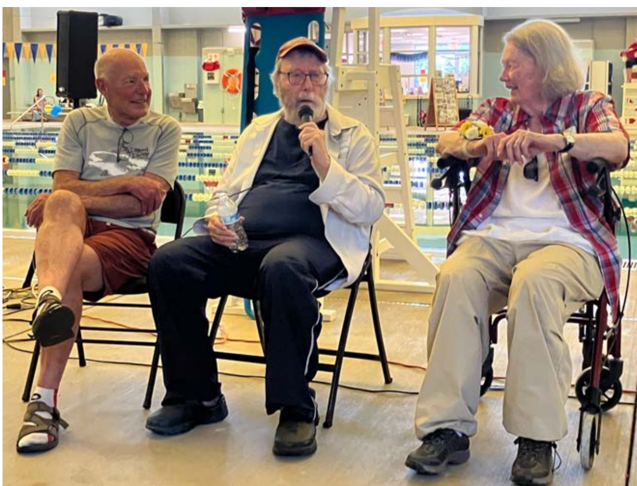
Cindy Weeldreyer / Cottage Grove Sentinel

Storyboards assembled by local historian and archivist