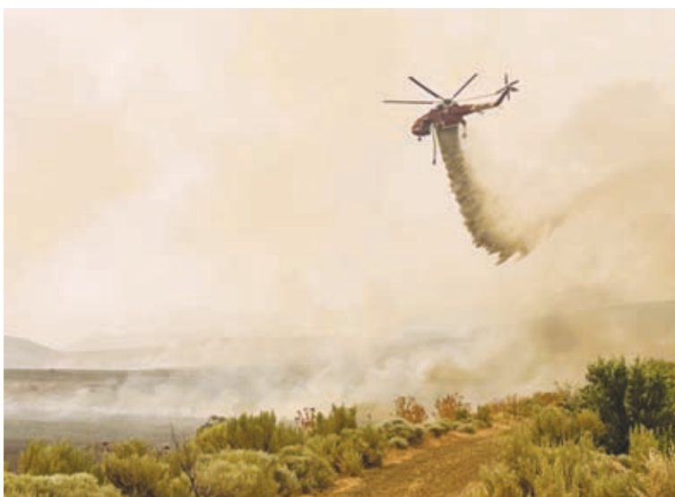
A helicopter drops flame retardant on the Cow Valley Fire in eastern Oregon on July 12, 2024. Scientists expect wildfires to continue to intensify with climate change.

"Increasing heat, dry vegetation and shifting winds continue to align and create dangerous conditions that demand immediate action," Kotek said in a statement. "Throughout the summer, it will get hotter and drier. Oregon has record-setting low snowpack, and nearly