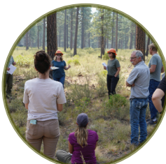
National Environmental Policy Act (NEPA) Planning