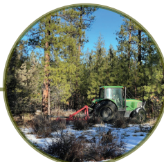
Mowing & Mastication