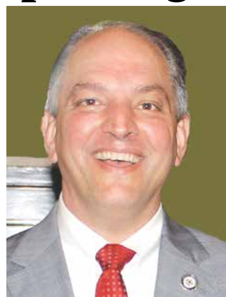
Gov. John Bel Edwards

to do so by a State Police officer. He led the police on a chase at speeds of 115 miles per hour.