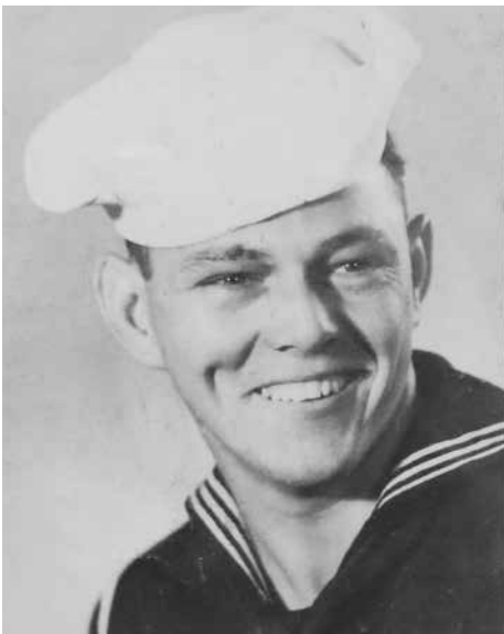
One of the photos that could be claimed.