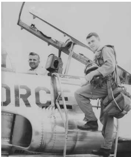
HISTORIC PHOTOS of Central area servicemen were at American Farmhouse during the August 2016 flood, and most survived.