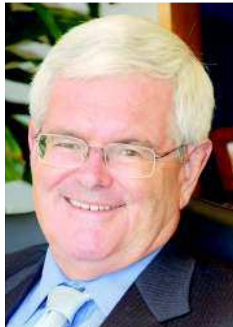
Speaker Newt Gingrich