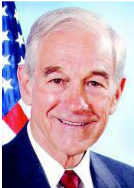
Congressman Ron Paul