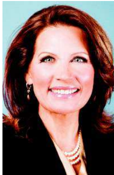
Congresswoman Michele Bachmann