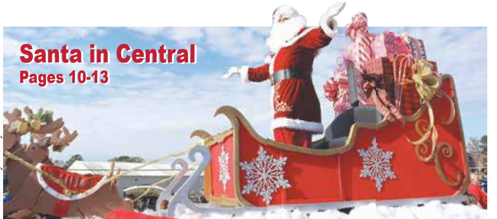
Santa in Central Pages 10-13