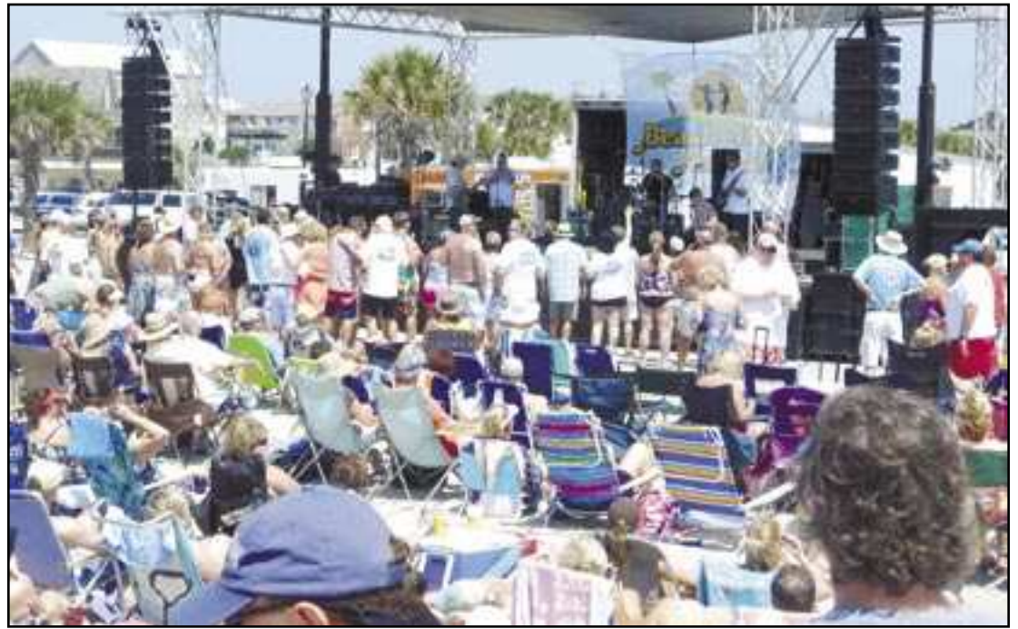
A huge crowd gathers at the public beach in front of the Atlantic Beach Circle for the Atlantic Beach Music Festival. This year's festival is Saturday, May 19.

For sponsorship info and details visit http://atlanticbeach-nc.com/events/beach-music-festival/ .