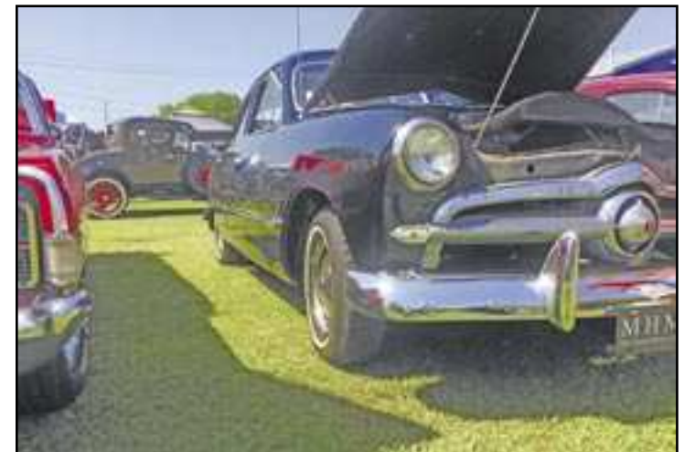
A 1949 Ford Coupe is on display during the 44 th annual Morehead City Antique Auto Club of America Car Show held at Katherine Davis Park in Morehead City.