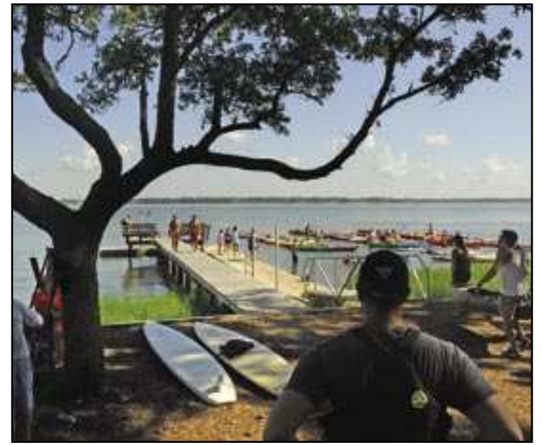
Kayaks, canoes, row boats and paddleboards prepare for the start of the 10 th annual event that raises money for Hope for the Warriors, which assists injured veterans and service members. This year's event is Saturday, June 2.

Finally, the kayak and paddle board race itself will be held at Garner Park June 2. Registration is $50, which includes a T-shirt and lunch. Racers are encouraged to raise at least $100 in additional donations from sponsors. For each dollar raised, 1 second will be deducted from their raw race time.