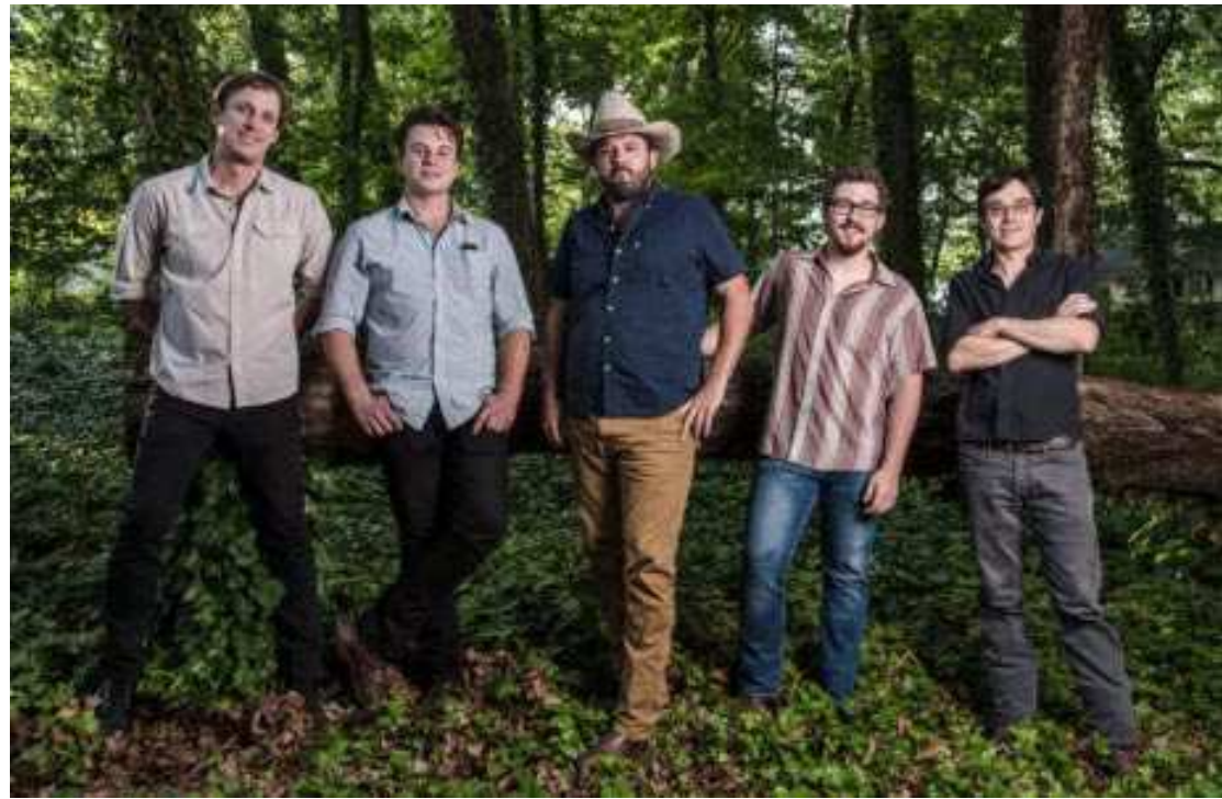
Raw, soulful and with plenty of swagger, Town Mountain will perform Friday, May 18th, from 8:45 to 10:15 p.m. at the Beaufort Music Festival.

Folk, country and bluegrass with elements of classical, jazz, blues and psychedelic flair. Violet Bell cites a wide range of influences – from Debussy to Neil Young, D'angelo to Lou