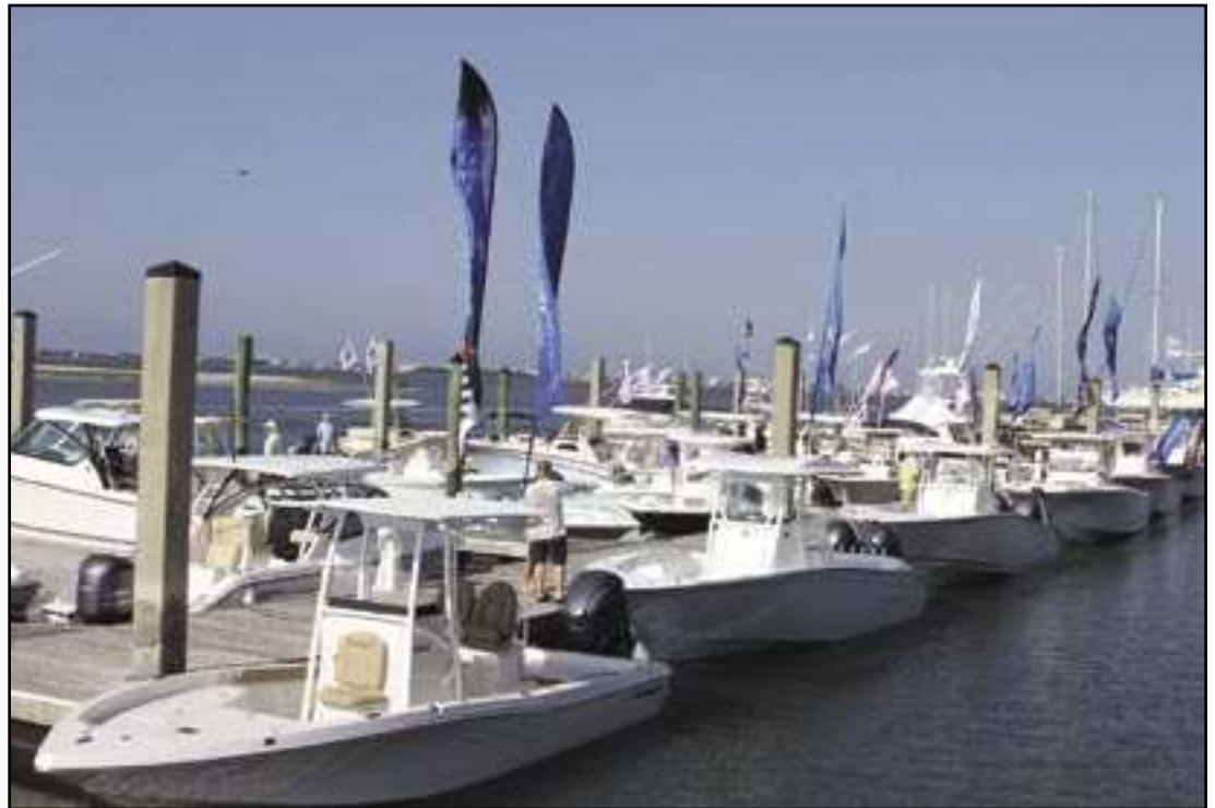
Boats line the Morehead City Docks during the 10 th annual Crystal Coast Boat Show. This year's event is Saturday-Sunday, May 19-20.