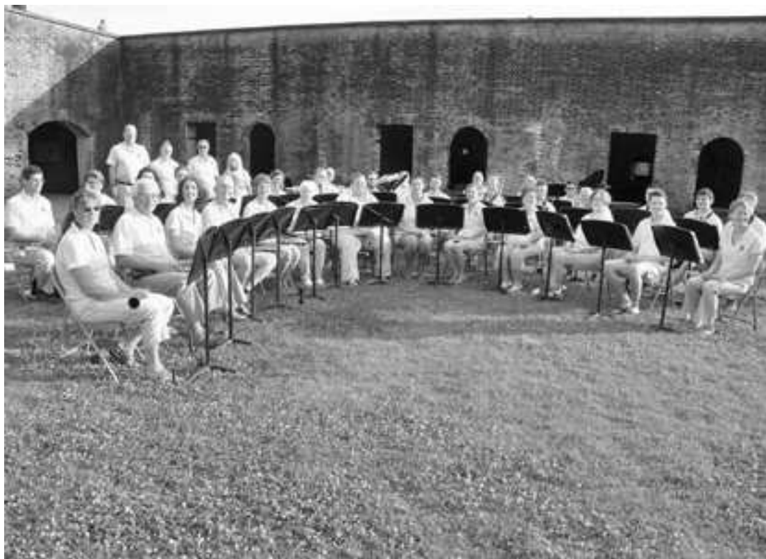
The Friends of Fort Macon's free concert series will begin Friday, May 25, featuring the Sunshine Band. Concerts are free and open to the public.

The free concert series offered by the Friends of Fort Macon is back again for its 21 st season.