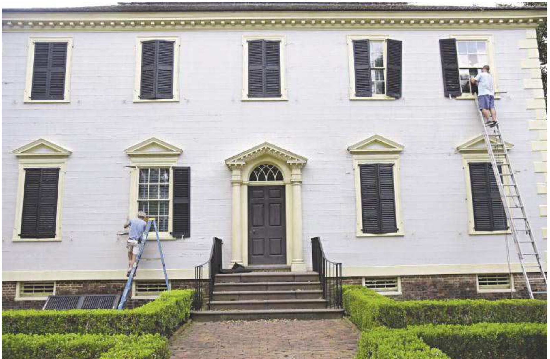
Tryon Palace is open but still recovering from Hurricane Florence.