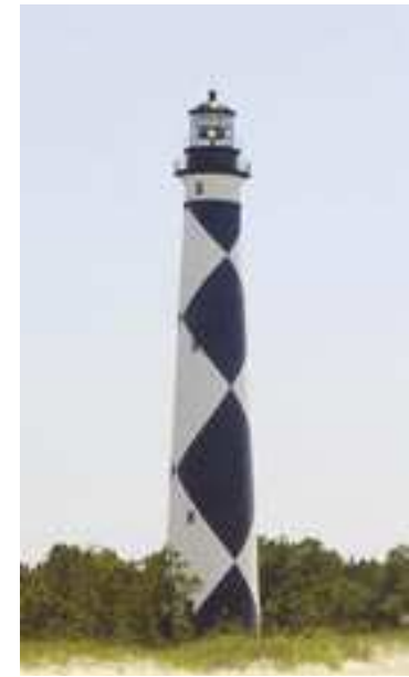
The Cape Lookout Lighthouse will be open to climb for free from Friday, Oct. 5 to Monday, Oct. 8 on a first-come, first-served basis. This will be the last climb for the year, rescheduled due to the hurricane.

This will be the last chance to climb the lighthouse in 2018. Originally, public climbing was scheduled to end Sept. 16, but the schedule was interrupted by the hurricane.