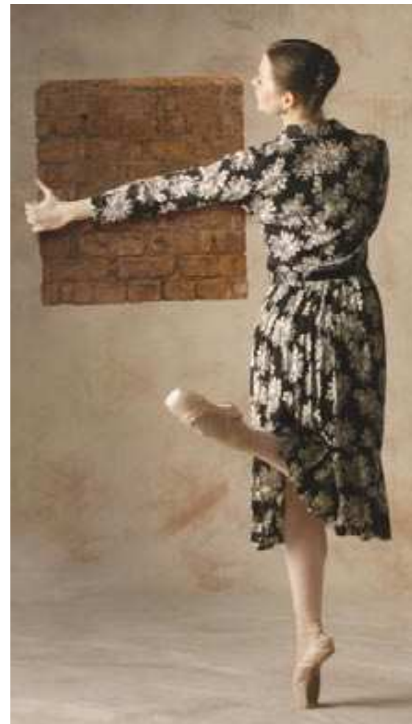
Ballerinas with Ballet Magnificat perform scenes from the ballet “Hiding Place.” The performance will show in the county at 7 p.m. Friday, Oct. 19 in the West Carteret High School auditorium. Tickets are on sale.