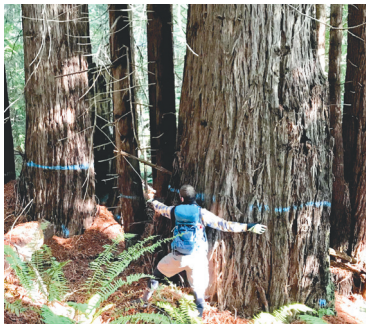
Large second growth, 77 inch diameter at breast height, marked for cut in the Caspar 500 THP.