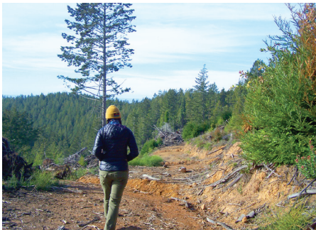
Bare soil showing few signs of regeneration with drought conditions. 2018 clear cuts in Caspar Creek.