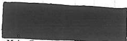
Major General, USA Commanding General Permanent Orders, 153-001