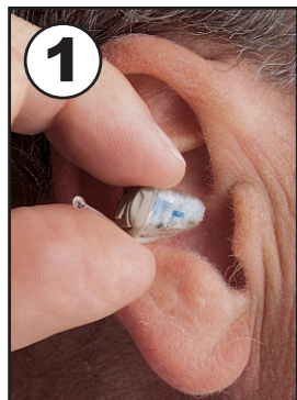
The hearing computer is fully automatic.