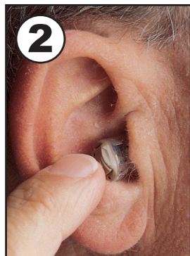
Just slip it in.