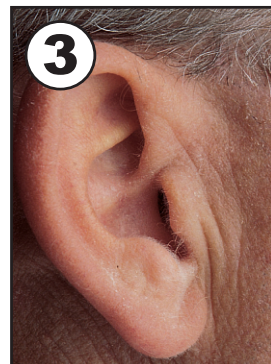
It is hidden inside and hearing is easy.