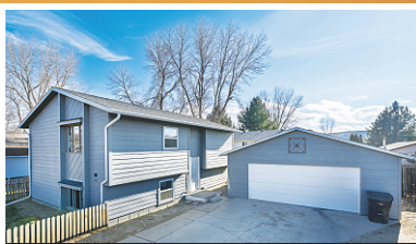
4012 Cambridge Dr. - $319,900

Updated 4-bedroom, 2-bath split-entry home offering 1,686 sq. ft. of comfortable, bright living spaces. The upper level features a spacious living room, kitchen, dining area, two bedrooms, and a full bath. The daylight basement includes a family room, two additional bedrooms, a full bath, and laundry area. Recent updates include all new flooring throughout, new interior paint, new light fixtures & a new roof. Plenty of storage with several storage and linen closets. Enjoy the convenience of a heated detached double garage with a new door and opener.