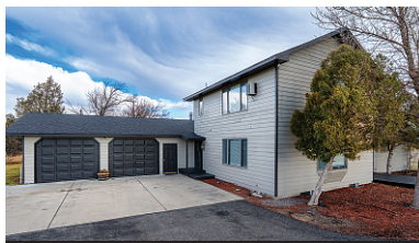
3514 S. 60th St. W. - $1,077,000

Enjoy unbelievable views of all the surrounding mountain ranges and the Yellowstone River Valley from this scenic 40 acres located just 5 miles south of Billings. Experience quiet, peaceful country living w/ abundant wildlife. Take it all in while enjoying a cup of coffee from your future deck overlooking a tree filled ravine. Ephemeral stream to the south, fed by a spring on a neighboring lot. Existing piers, 2-2200 gal cisterns, power, septic system, 2 fenced pastures & a 2-stall animal shelter w/enclosed tack room on lot 3. Previously plowed area for a horse training arena. Option in ccr's to build a small guest cabin or lot #8. The upper 20 acre lot #3, has Southridge ccr's (no mod/mnfrd homes allowed) & cannot be further subdivided protecting your privacy. The lower 20 acre lot #8 is Zoned D-14 agricultural with no ccr's.