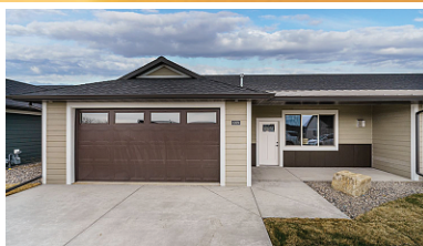
Signal Peak Townhomes - $342K-$357K

This charming 5-bedroom, 2-bath bungalow offers 1,624 sq. ft. of inviting living space in a prime location near McKinley Elementary School, the Senior High School, Pioneer Park, and downtown. You'll appreciate the classic character throughout, featuring coved ceilings and hardwood floors. The main level includes a living room, dining area, kitchen, two bedrooms, and a full bath. Upstairs, you'll find two additional bedrooms, perfect for guests, a home office, or extra living space. The basement level features a fifth bedroom with a private bath, a laundry area, and a convenient dog shower. Outside, enjoy relaxing on the covered front porch, along with mature trees, a fully fenced backyard, and a storage shed—ideal for outdoor living and extra storage.