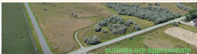
80th & Hesper Lot - $1,850,000

New roof! New exterior paint. Don't miss out on this rare find! Exceptional Westend property w/stunning views & striking craftsmanship. 4 Bed, 3.5 Bath, 3596 sq. ft. 2-story home on 20 acres. Entire upper level is a private master suite w/walk-in closet, jetted tub & stackable w/d hookups. Main level offers a formal LR w/french doors, bay & picture windows & recessed lights. Formal as well as informal dining areas. Kitchen w/island, pantry, & bay window. A spacious den w/wood stove & patio door to relaxing deck. 3 large bedrooms (2nd room w/private bath), laundry room & full bath. Unique study closets w/cabinets & counters in two of the main floor bedrms. Basement w/ FR, bonus room & ample storage. Additional highlights include well for house & yard, central vac system, double attached heated garage plus double detached O/S garage. Ideal for horse enthusiasts w/plenty of space; subdividable into two 10-acre tracts.