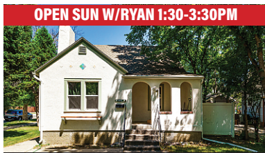
41 Avenue B - $339,900

Updated 4-bedroom, 2-bath split-entry home offering 1,686 sq. ft. of comfortable, bright living spaces. The upper level features a spacious living room, kitchen, dining area, two bedrooms, and a full bath. The daylight basement includes a family room, two additional bedrooms, a full bath, and laundry area. Recent updates include all new flooring throughout, new interior paint, new light fixtures & a new roof. Plenty of storage with several storage and linen closets. Enjoy the convenience of a heated detached double garage with a new door and opener.