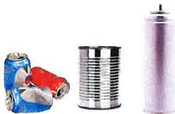
Aluminum cans, steel & tin cans