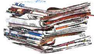
Newspaper, including inserts