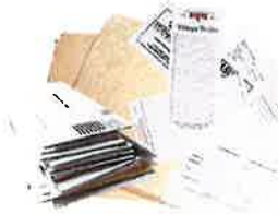
Office paper, junk mail, folders