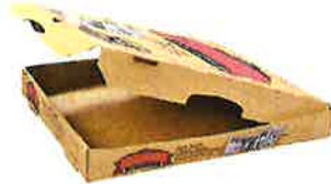
Clean Pizza Boxes