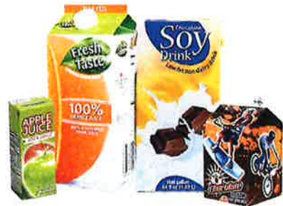
(caps and straws removed)