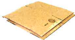
Cardboard (flattened to fit in your bin or cart)