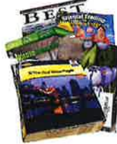
Magazines, catalogs and telephone books