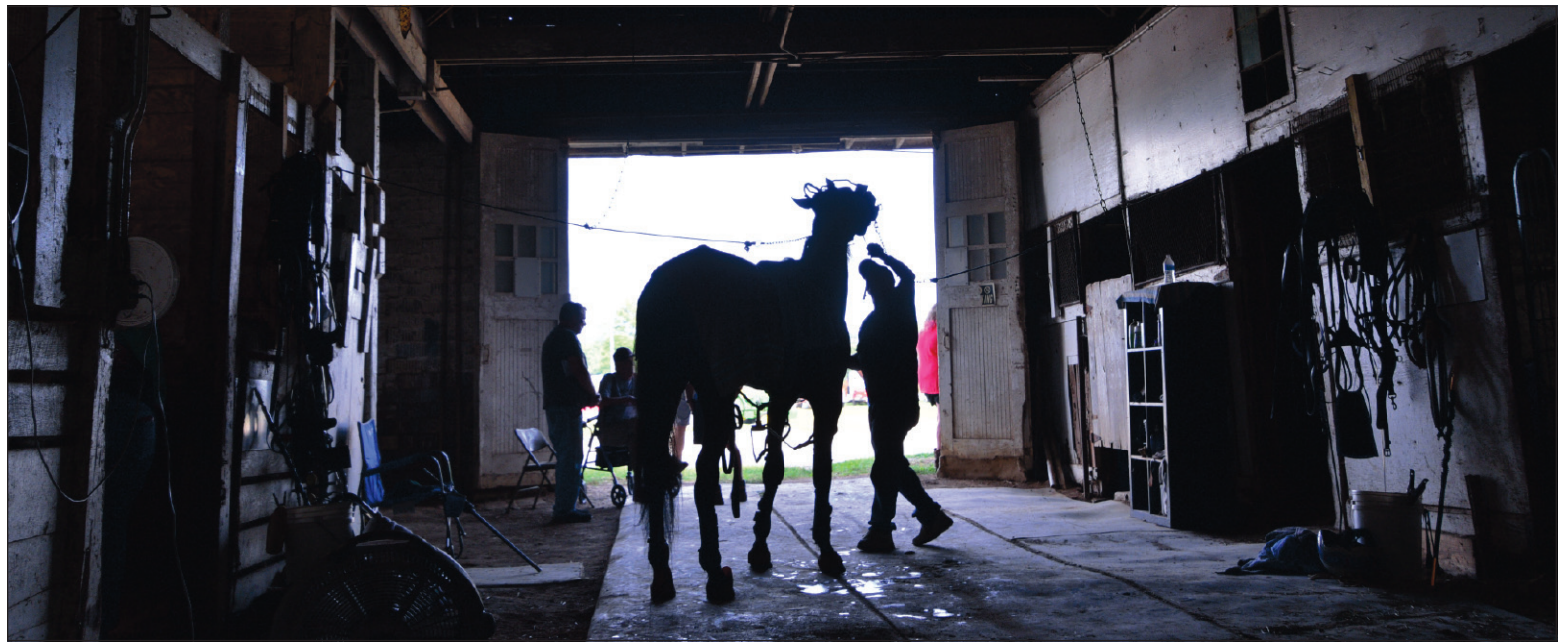
A horse is checked over by its handler at The 2021 Athens County Fair.