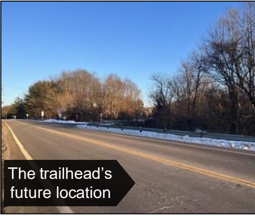
The trailhead's future location