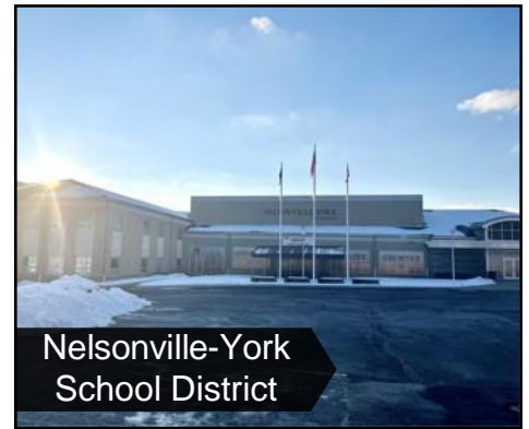
Nelsonville-York School District