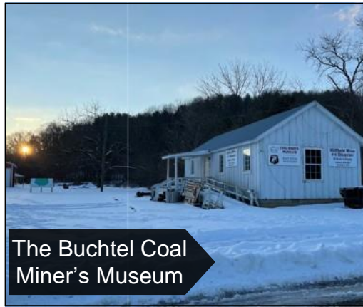
The Buchtel Coal Miner's Museum