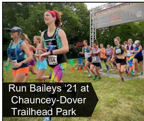
Run Baileys '21 at Chauncey-Dover Trailhead Park