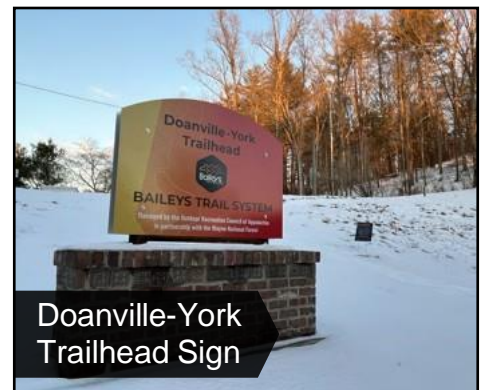
Doanville-York Trailhead Sign