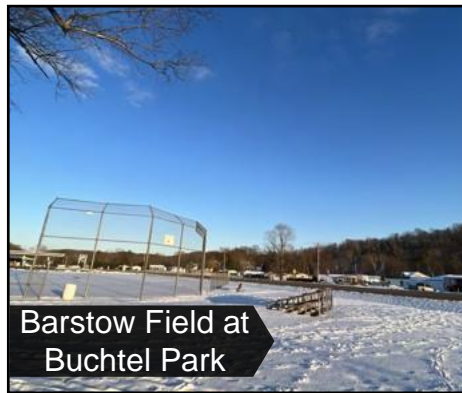
Barstow Field at Buchtel Park

Existing trailheads include the Chauncey-Dover Trailhead Park which is undergoing a $2MM renovation to be completed in Oct. '22. The Doanville-York Trailhead Park was completed in June 2021 featuring: restrooms, parking, and a pavilion.