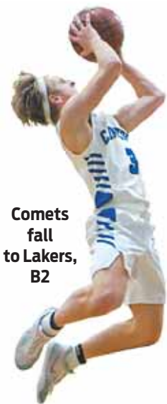
Comets fall to Lakers, B2

The road to Madison begins: Wisconsin’s high school boys’ basketball teams begin tournament play in five divisions Tuesday. Rice Lake will host Ashland in a Division 2 regional opener, Cameron hosts Boyceville in Division 4 and Birchwood hosts Frederic in Division 5. Meanwhile, girls’ basketball moves to the regional semifinals on Friday.