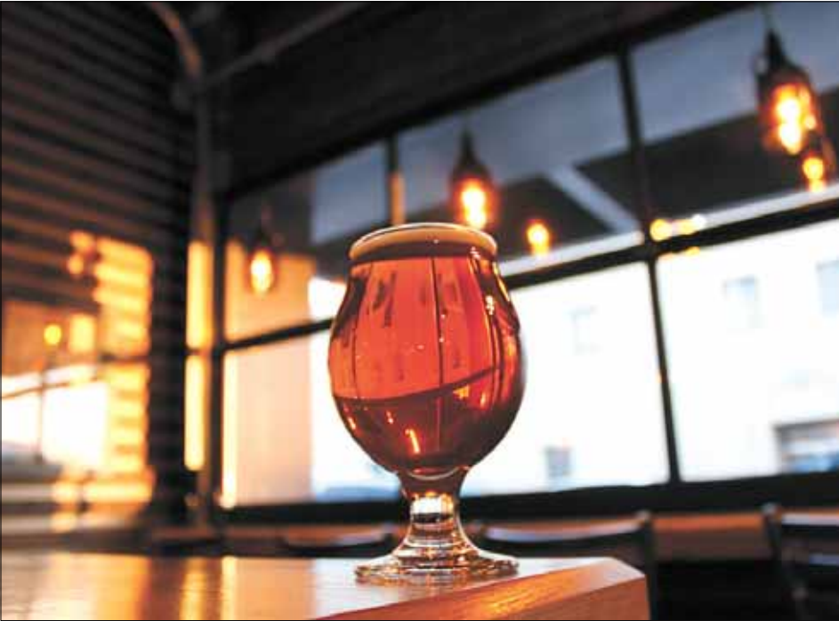
PHOTO BY RYAN URBAN Unleashed each winter, Bells Hopslam pours with an amber orange hue and has citrusy notes to match in aroma and flavor. Try it on tap at The Knapp Stout in Rice Lake.

overbearing thanks to a hint of sweetness provided by a robust malt. Extra malt in Hopslam boosts the ABV to 10%. But the real buzz is the six varieties of hops used, eliciting pungent citrusy tones akin to grapefruit, lemon and mango. This tangy treat appears on shelves late each January. While the hop-green packaging is enticing, getting it on tap is the tops. Locally, it can be found at none other than The Knapp Stout. A beer enthusiast can always count on KS having the best beers available, from the best barrel-aged stouts to fruit beers to honey blondes. There are of course many IPAs to choose from among the 20 taps. But it’s hard to pass up Hopslam, a hop cone crusher that takes some of the bite out of winter. —Ryan Urban