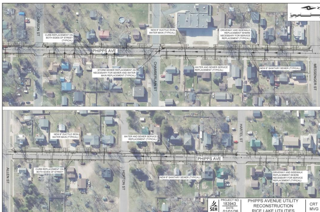
Figure 1 – Phipps Avenue Concept Plan

An illustration of the project’s scope is shown in Figure 1 and Figure 2.