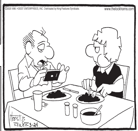
"NO, NOT FOR INSTAGRAM \dots IT'S EVIDENCE."