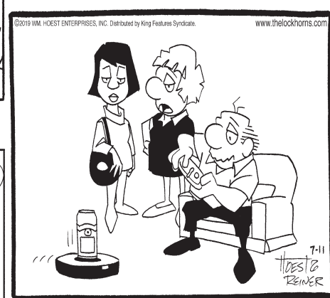
"ALL LEROY'S 'SHARK TANK' IDEAS SOMEHOW INVOLVE BEER."