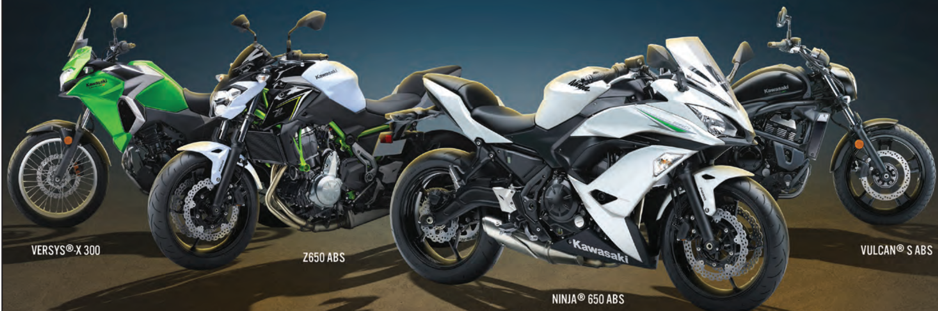
VERSYS® X 300