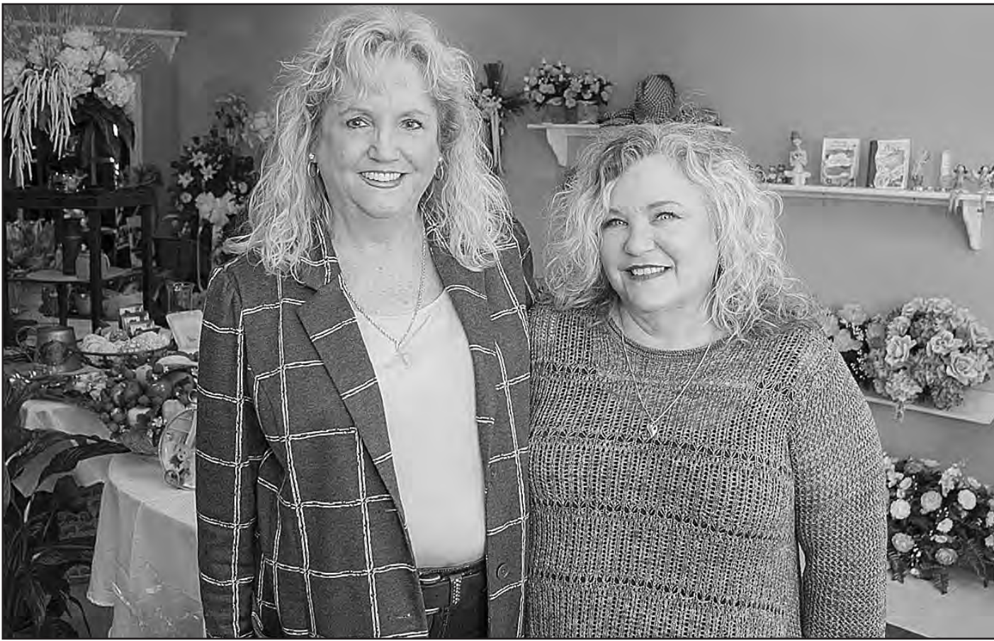
Tucker Webb/The Daily Home