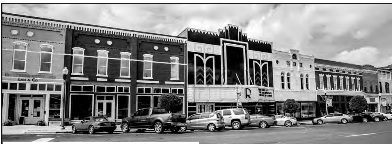
Talladega Chamber of Commerce officials hope to build on the organization's success during the past year with a full slate of events scheduled during 2017.