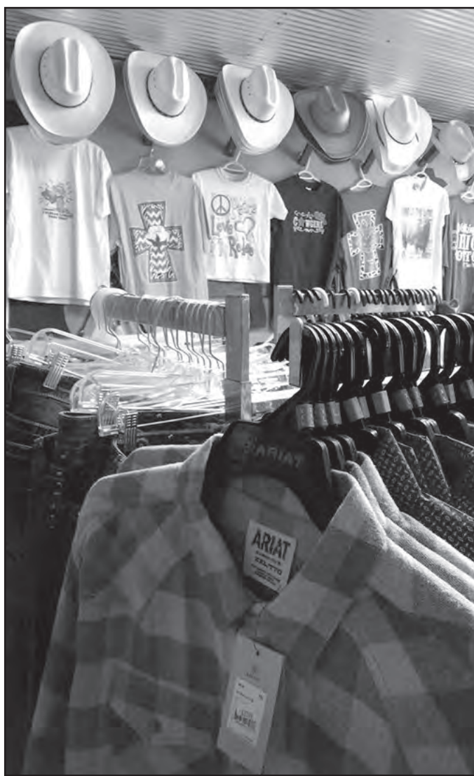
Oak Grove Corral opened in March as an addition to Oak Grove Feed & Tack at 39925 Highway 280. The specialty boutique offers clothing and gifts for men, women and children.