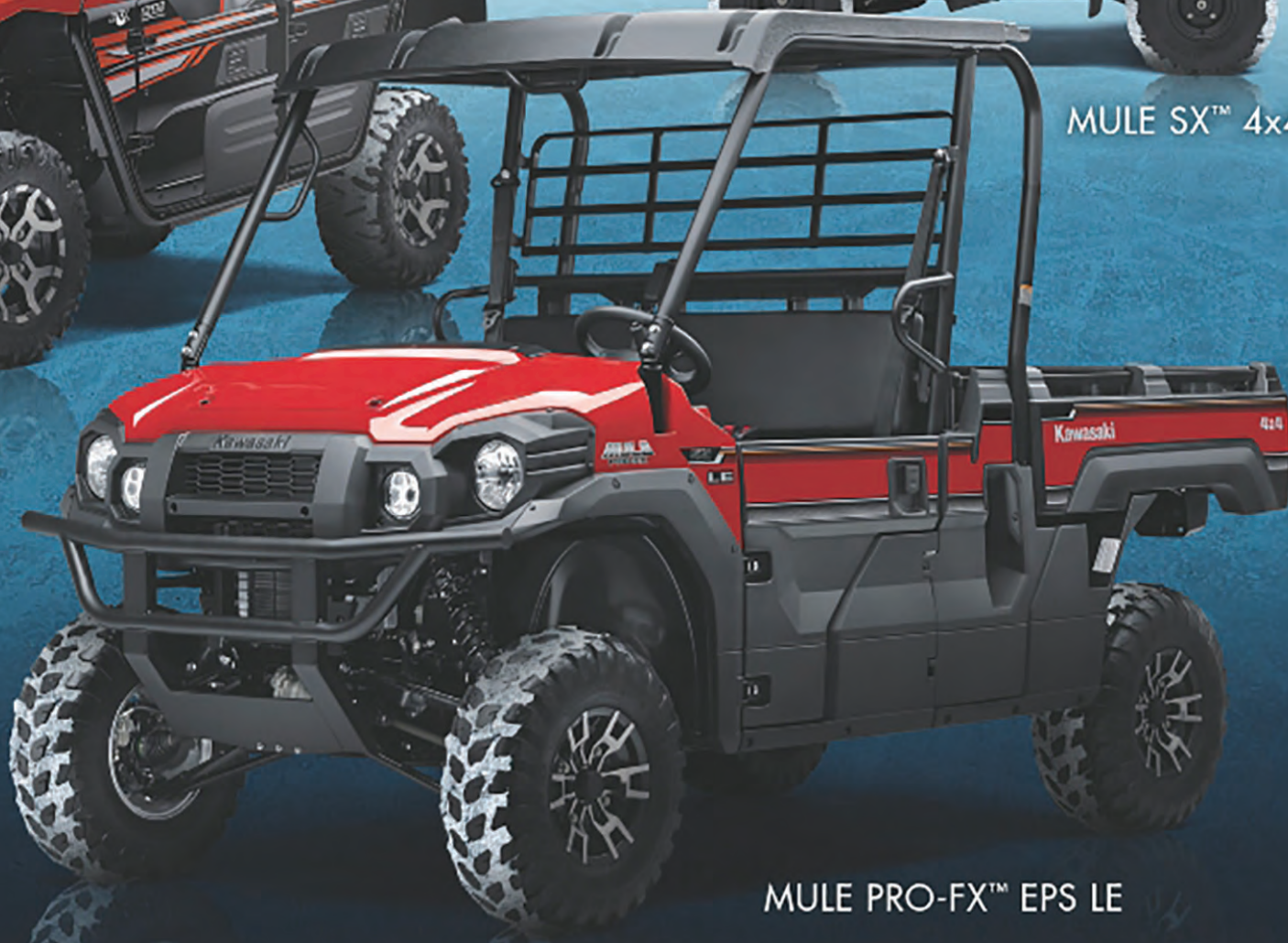
MULE PRO-FX™ EPS LE