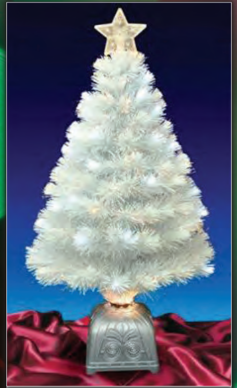
4' PRE-LIT TREE $19 99

ALL CHRISTMAS ORNAMENTS BUY ONE GET ONE 50% OFF