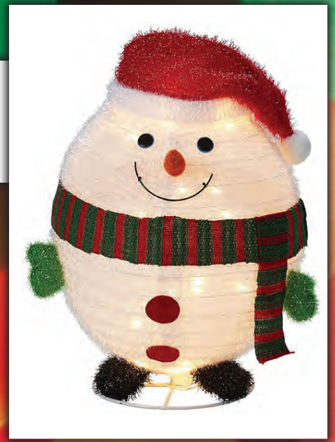
20" PRE-LIT SNOW MAN $9 99