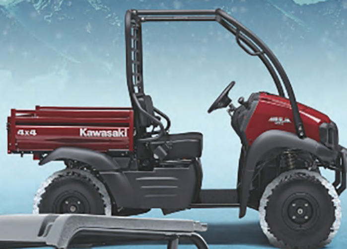
MULE SX™ 4x4