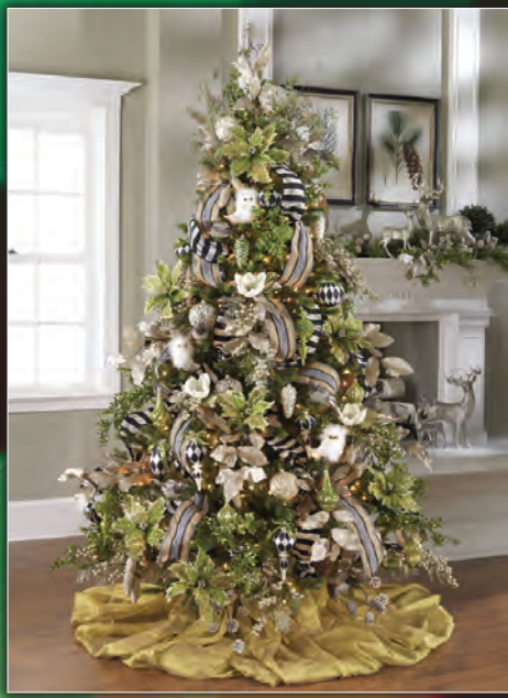
7' PRE-LIT TREE $49 99