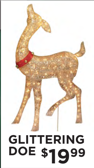
GLITTERING DOE $19 99

ALL CHRISTMAS ORNAMENTS BUY ONE GET ONE 50% OFF