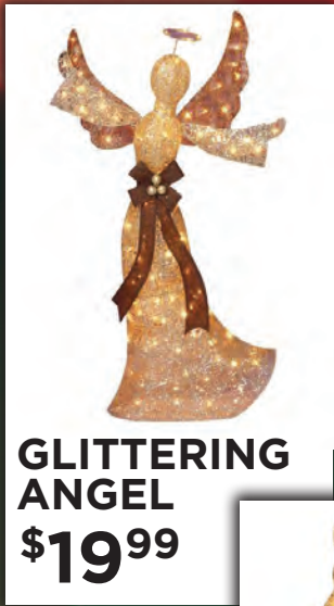
GLITTERING ANGEL $19 99