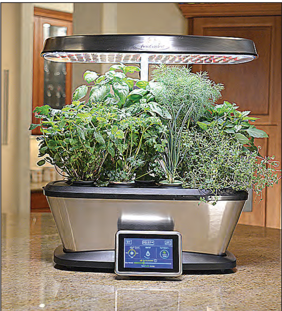
Hydroponic gardens like the AeroGarden grow fresh herbs, vegetables, and flowers in water, not soil. And they actually grow five times faster than soil gardens.