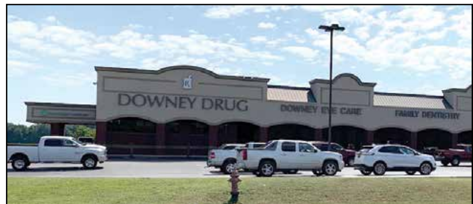
Downey Drug in Alexandria.