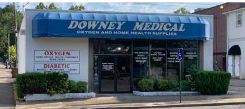
Downey Medical in Anniston.