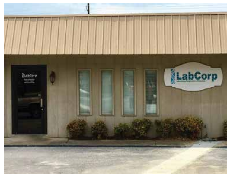
LabCorp of Anniston is located at 1412 Leighton Ave.

In another statement, LabCorp wanted to thank the clients for their vote. "We take pride in being able to provide high-quality testing and exceptional service and hope that our clients see and feel that each and every time they send a specimen to LabCorp. We are proud to be part of the Anniston community."