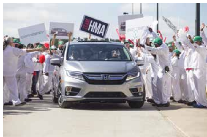
Honda Manufacturing of Alabama associates celebrating the start of mass production of the all-new 2018 Honda Odyssey minivan in April 2017. HMA is the exclusive manufacturer of the family-friendly Odyssey.

Since the start of production on Nov. 14, 2001, HMA has produced nearly 5 million vehicles and V-6 engines at its 4.2 million square foot facility in Lincoln. Approximately 23 percent of HMA's workforce live in Calhoun County. Honda's global vision is to provide products of the highest quality at a reasonable price for worldwide customer satisfaction. Honda has been producing automobiles in America for more than 36 years and currently operates 19 major manufacturing facilities in North America. In 2017, more than 90 percent of all Honda brand vehicles sold in the U.S. were made in North America, using domestic and globally sourced parts.