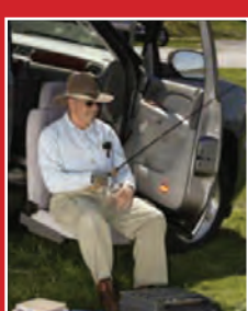
Turning Automotive Seats