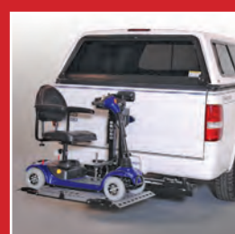
Interior/Exterior Vehicle Lifts