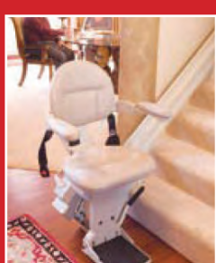
Straight & Curved Rail Stairlifts