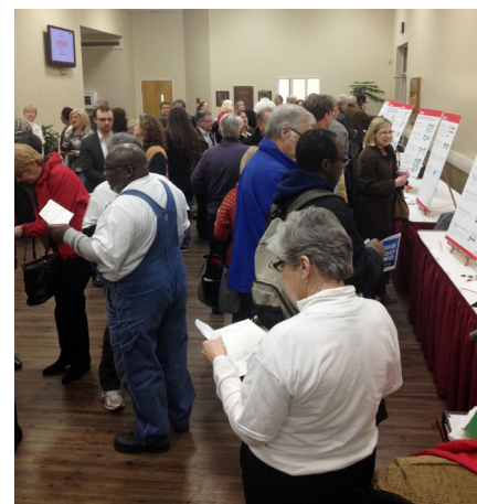
Participants identified the actions they felt were most important during the Open House.