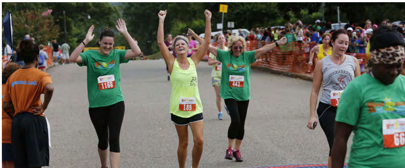
Woodstock 5K participants celebrating their finish at the 2014 race.