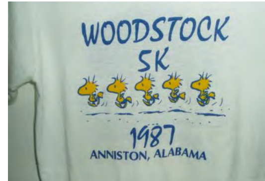
Woodstock 5K 1987 race shirt.