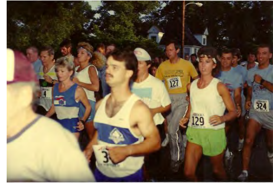
Woodstock 5K 1989 race.

by Neeli Faulkner Woodstock 5K Co-Director