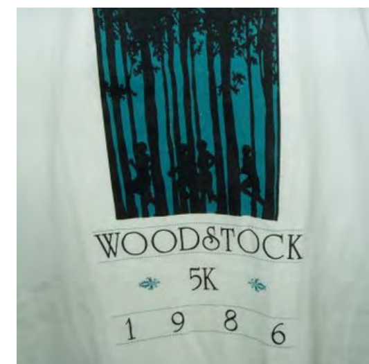
Woodstock 5K 1986 race shirt.