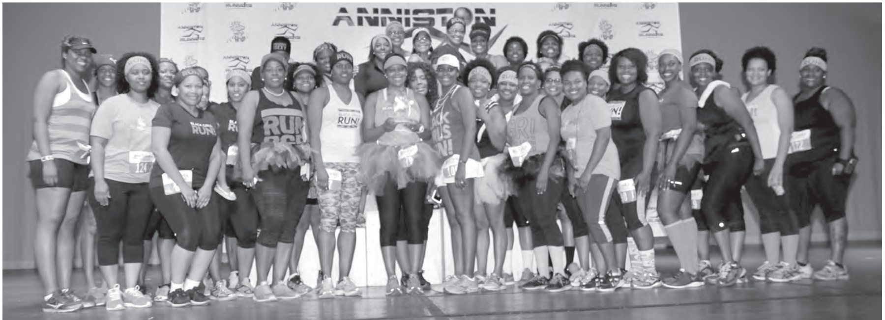
Caption: Team Black Girls Run took home the Team with the Most Participants award and the cash prize in 2014!