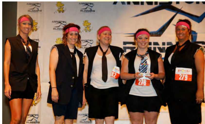
Caption: Team Mayhem (inspired by the Allstate commercials) took home the coveted Most Spirit Award in 2014!