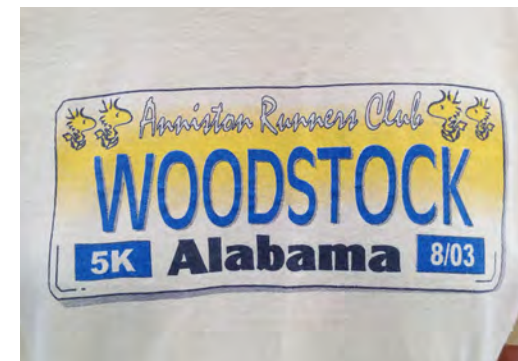
Woodstock 5K 2003 race shirt.