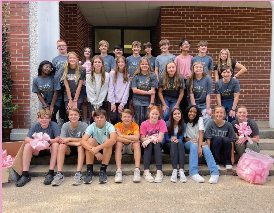
Members of Springville Middle School's Junior Beta Club