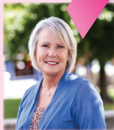
Blessed to be an 8 year breast cancer survivor!