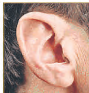
Micro Completely- in-Canal (CIC)