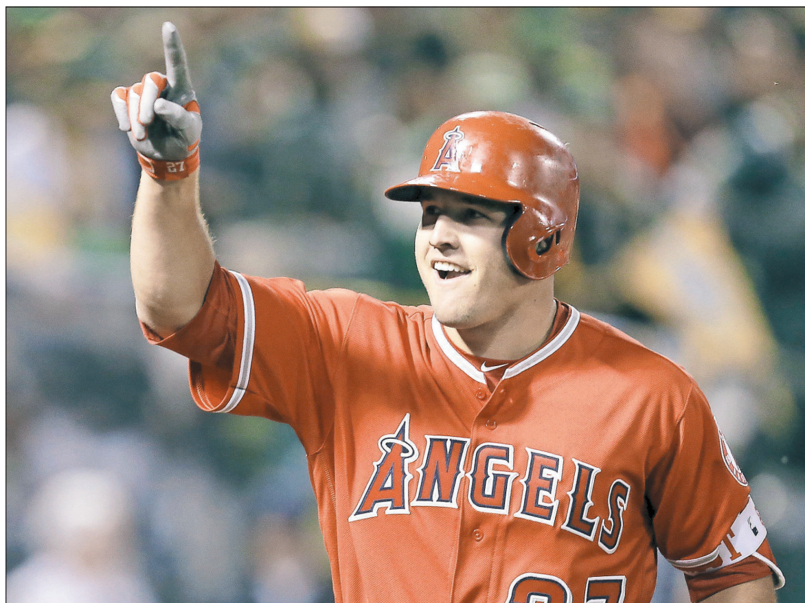
Mike Trout will earn every penny of his mega contract this season and will bring home the AL MVP.

After a sneaky good but unheralded 2018 season, Bogaerts returns to the All-Star Game in his walk year.