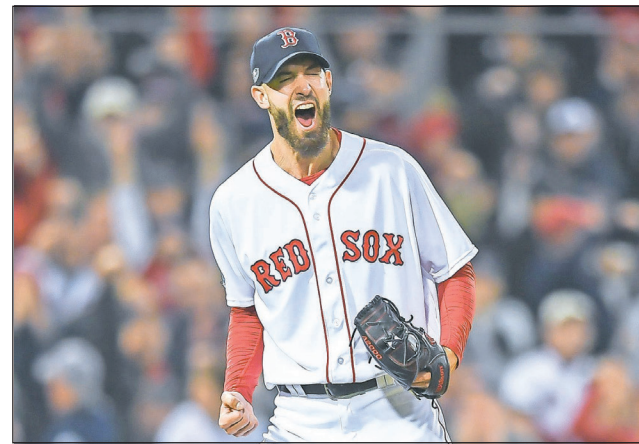
Pitcher Rick Porcello was instrumental in bringing a World Series to Boston.