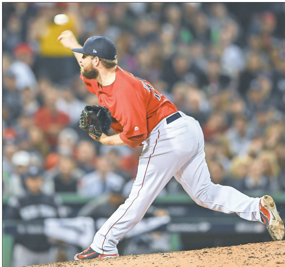
With Craig Kimbrel and Joe Kelly gone, Ryan Brasier will be asked to pick up where he left off last season.