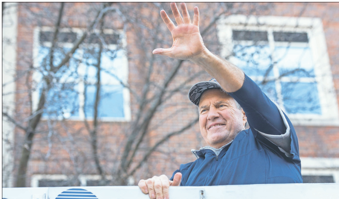
Patriots head coach Bill Belichick waves to fans during the victory parade in February. By now, his attention has turned to next season.