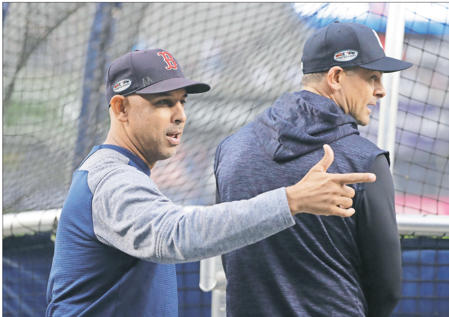
Alex Cora gives credit to the Red Sox organization for consistently putting together playoff contending teams.

“This team has put themselves and this organization in a spot to win the World Series the last three years. That’s what it’s all about — give yourselves a chance throughout the season to make the playoffs,” he said. “You make