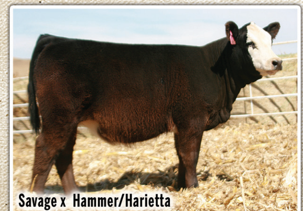
Savage x Hammer/Harietta