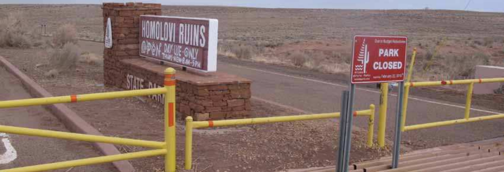
Homolovi State Park in Arizona has faced periodic closing because of budget problems.

Across the country, recreation areas are being hit hard by state budget cuts.