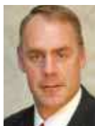
Senator Ryan Zinke Montana