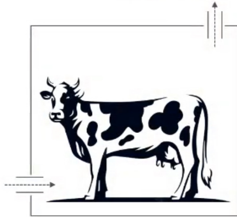
respiration chamber (gold standard)